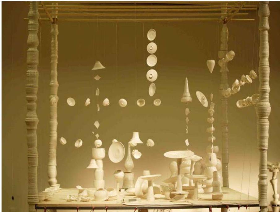
The Porcelain Project / Installation © Needcompany