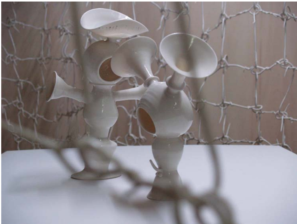
The Porcelain Object | Laissez la porte Museum Dr. Guislain, Gent