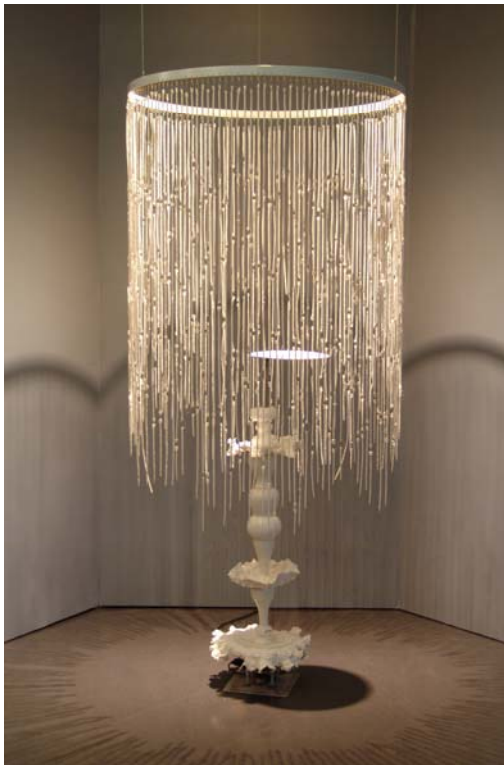
Le Tourneur de Toulouse

Le Tourneur de Toulouse (2008) was exhibited at Théâtre Garonne.