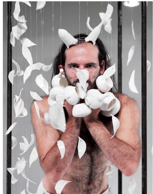
The Porcelain Project / Performance