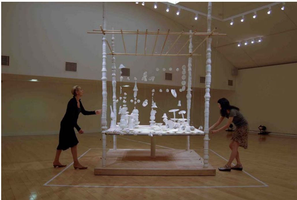
The Porcelain Project / Installation Benaki Museum, Athens