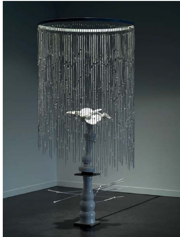
Le Tourneur de Strombeek