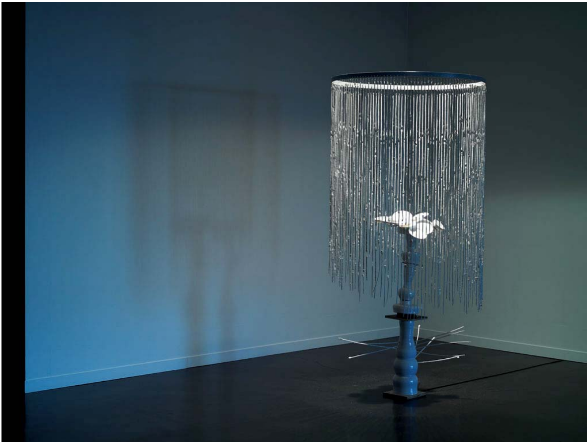
Le Tourneur de Strombeek © Miel Verhasselt

A Needcompany production With the support of the Flemish authorities