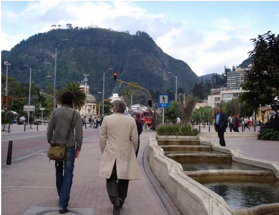
OHNO COOPERATION

OHNO COOPERATION embodies the cooperation between Maarten Seghers and Jan Lauwers. Up to now this has mainly taken the form of listening to, thinking about and making music and art. The compositions and songs were either for specific purposes ( Images of Affection , No Comment , Needlapb ), independent and for no particular purpose ( The Grenoble Tapes , et al.) or else given visual form ( O.H.N.O.P.O.P.I.C.O.N.O. installation).